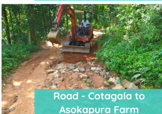
Road - Cotagala to Asokapura Farm