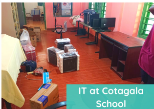
IT at Cotagala School