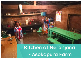
Kitchen at Neranjana - Asokapura Farm