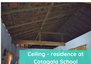
Ceiling - residence at Cotagala School